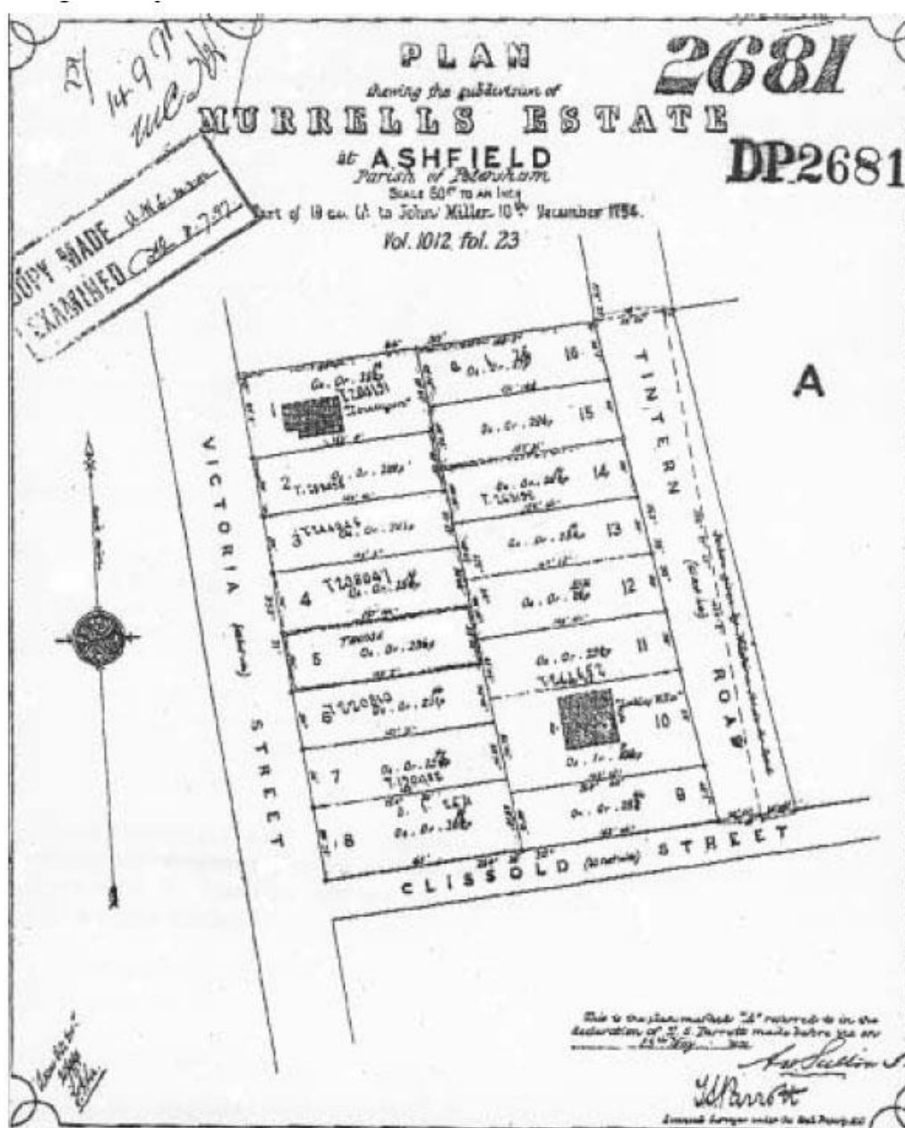
Above: The Deposited Plan for Murrell's Estate subdivision, prepared by surveyor T S Parrott and dated 1891. (Copy by courtesy of Councillor Caroline Stott). The estate and its surroundings are also shown on the H E C Robinson map of Ashfield South Ward, first prepared in 1912 (Ashfield Council Archives). Note that Tintern Road has been slightly canted to provide a direct link to Victoria Square.